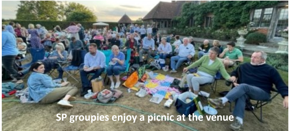
SP groupies enjoy a picnic at the venue