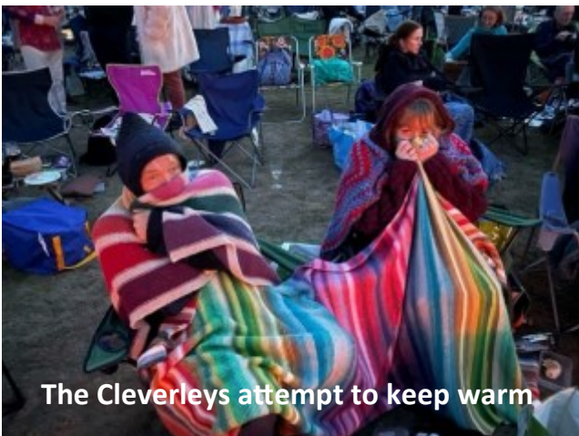
The Cleverleys attempt to keep warm