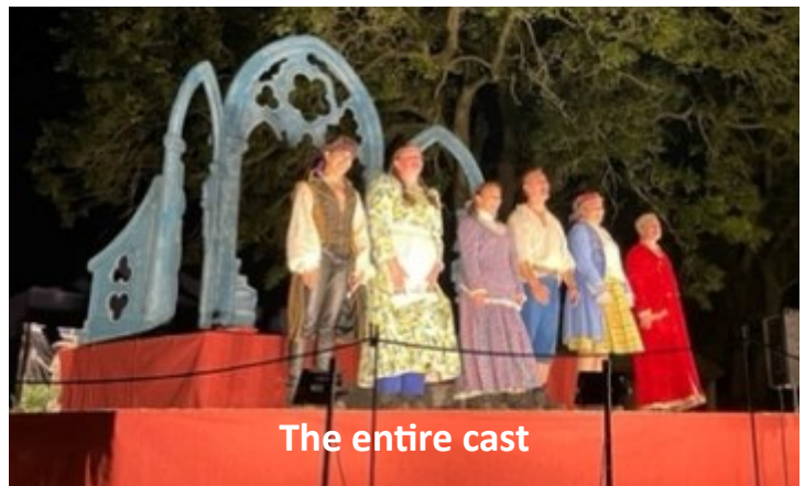
The entire cast