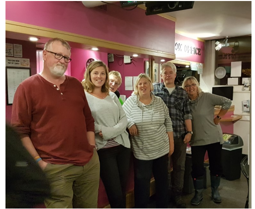
The Foyer Clean-up Gang Mk II

Thanks to each and everyone of you that lent a hand to the annual clean-up operation. A job very well done!