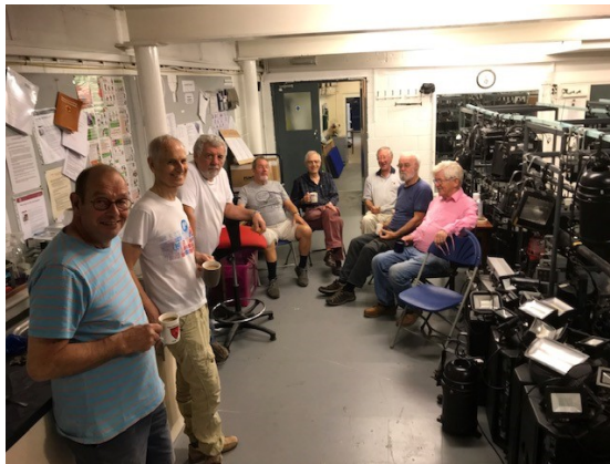
The indefatigable work-shoppers sat around and drank tea! (but only once they'd exhausted a long list of 'jobs to do').